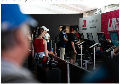
Covers Pulled Off Le Mans Ultimate Game at Centenary 24 Hours of Le Mans